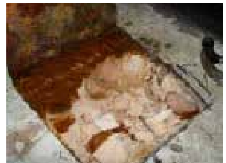
Core Sampling an 'ice-logged' panel

"By taking this approach, the owner/operator of a large store can save many hundreds of thousands of pounds by only replacing the damaged panels."