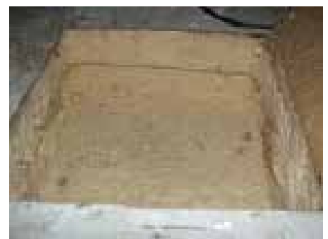
Core Sampling a 'dry' panel