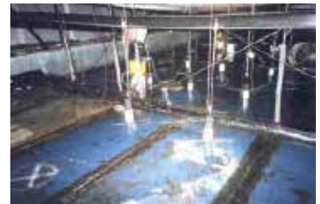
A waterlogged roof void

"Poor vapour sealing will exacerbate the panel deterioration....In actual case studies, FJB Systems have found that panel weights can increase up to 30 times their original values..."